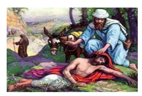
Sunday 10<sup>th</sup> July 2022

Part of the North Connor Pastoral Community